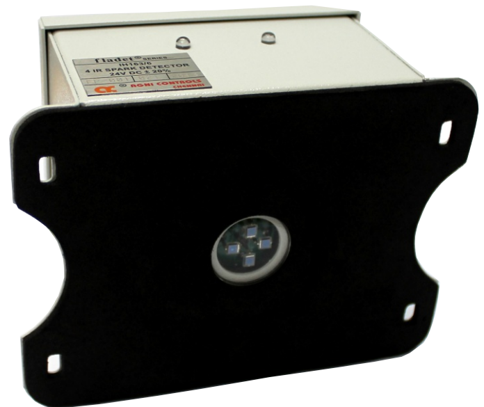
IH163/6 4 IR SPARK DETECTOR MODULE