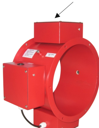
SPARK DETECTOR ASSEMBLY - IH163/1-4 NI*