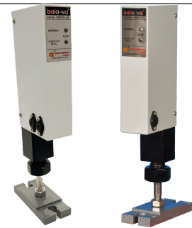
4 WIRE INPUT

Online Monitor Normal Indication is used in Gas based Fire Extinguishing System to monitor the weight level agent in the cylinder. When the quantity of the gas is reduced below 10% of its original filled quantity, the alert Indication (YELLOW LED) is shown.